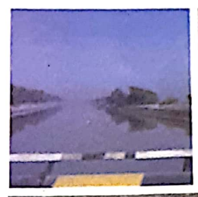
Cactus in a Desert Indira Gandhi Canal