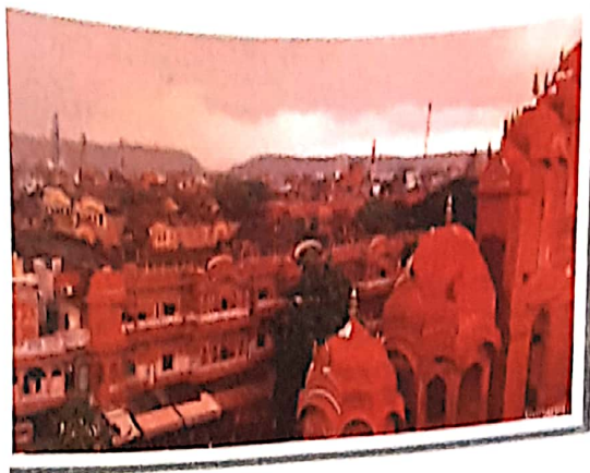
The Pink City - Jaipur

known as the Pink City . The other big cities of Rajasthan are Kota, Jaisalmer and Bikaner. Rajasthan attracts a large number of tourists every