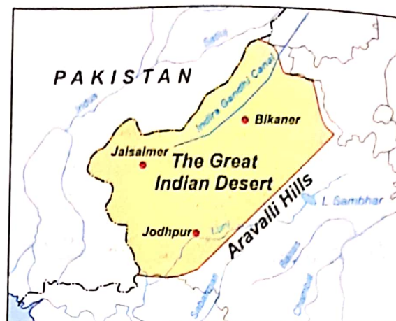
The Western Desert Region of India

Water is scarce, so people who live in the villages have to walk long distances to fetch water for domestic use. The Rajasthan Canal , also known as the Indira Gandhi Canal has been built to provide water for domestic use as well as for irrigating the fields. It is one of the largest canals in the world. The canal water helps the farmers in irrigating their crops.